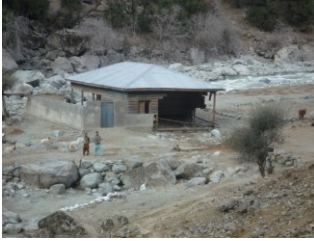
Die Schule im Nov. 2010, nachdem der reißende Fluss die Vorder- und Rückseite weggerissen hatte. Wochenlang war die Schule eine Insel im Fluss gewesen.