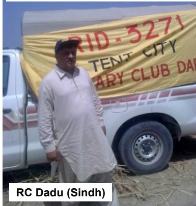
RC Dadu (Sindh)

11 Nothilfprojekte wurden unterstützt, davon 5 mit pakistanischen Rotary Clubs