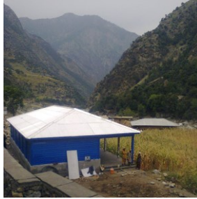
Die neu aufgebaute Schule, weit oberhalb der alten (im Hintergrund) im Okt. 2012.