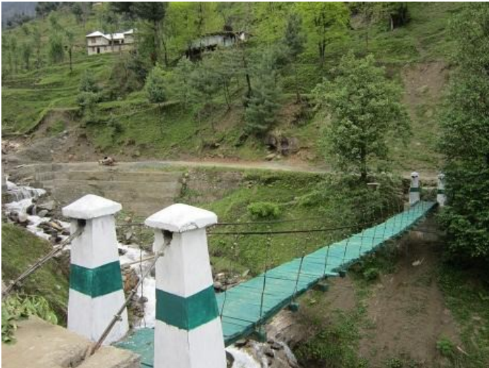
The new project with financial support from ICC/RDG Suspension bridge built in Ajmair, Shangla district

To finance this bridge construction project of Welthungerhilfe, ICC/RDG have provided 54,600 € in three tranches on the basis of ICC/RDG detailed project calculations, Approximately 1,100 households with a total of approx. 11,200 people will benefit from the construction of the five suspension bridges. At all five bridges, the funding from Rotary Germany is marked.