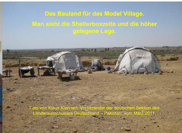
Foto von Klaus Klennert, Vorsitzender der deutschen Sektion des Länderausschusses Deutschland – Pakistan, vom März 2011.

Das Bauland für das Model Village. Man sieht die Shelterboxzeite und die höher gelegene Lage.