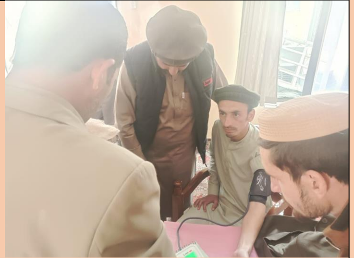
How to use a BP Apparatus, Training