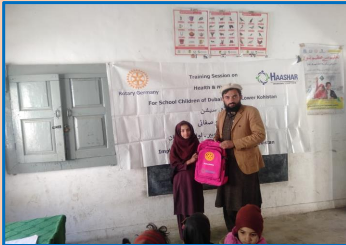
Distribution of School bags in local School