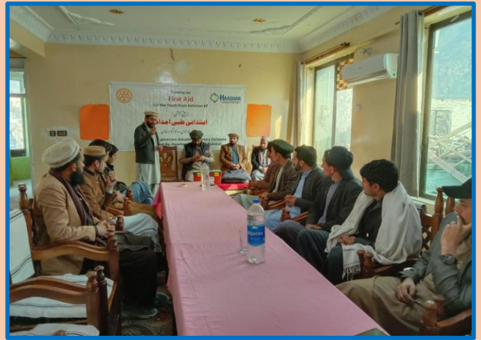
CEO Haashar Association addressing the training participants