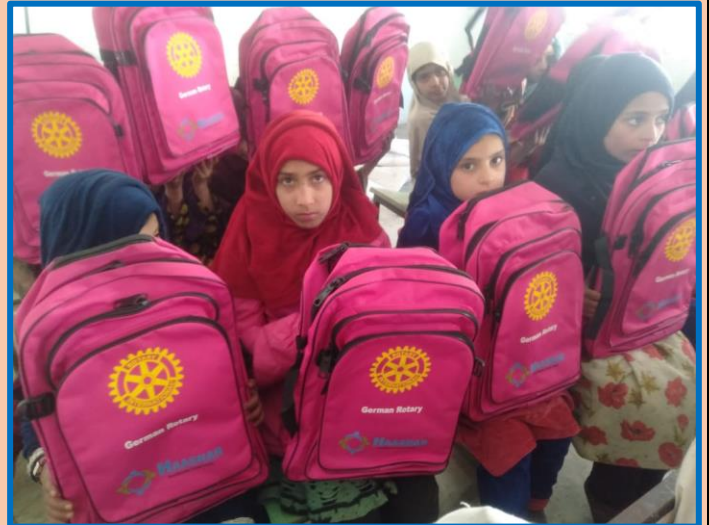
Little angels with new school bags