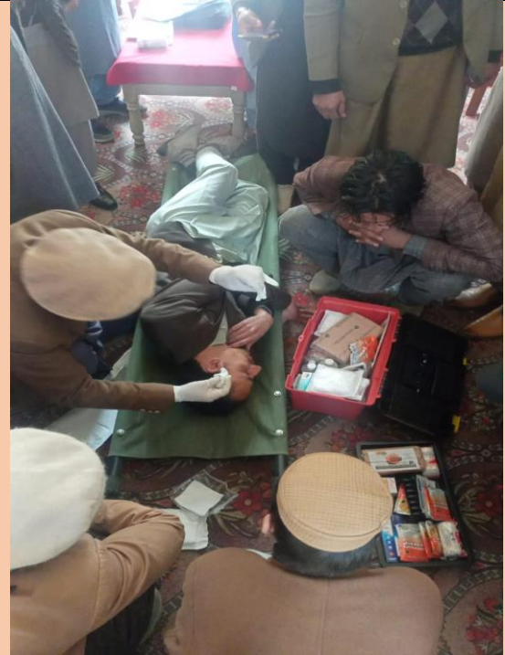
Bandages to an injured person, First Aid Training