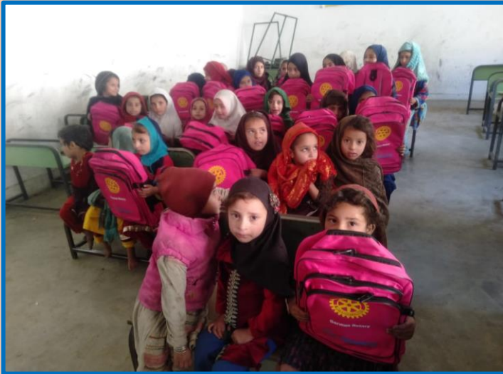
Girls with new School Bags in Dubair Bala