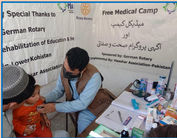
Children being examined during Medical Camp at Dubair Bala