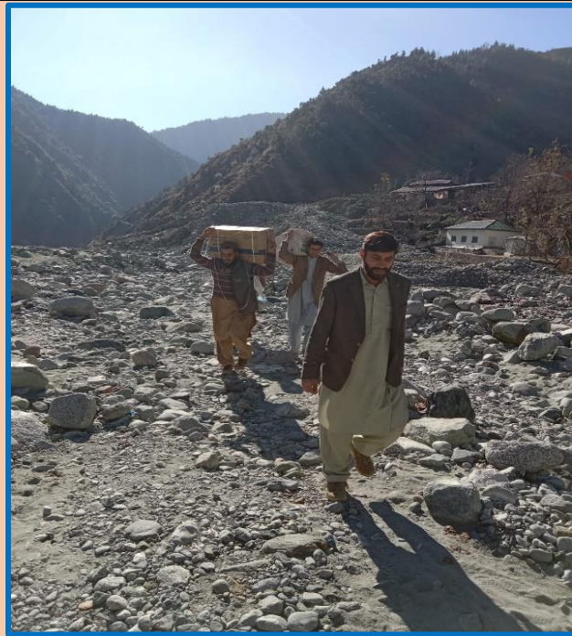
Transportation of Medicaines for Medical Camp