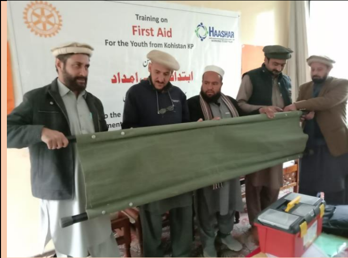
Stretchers being handed over to Kohistani Communities