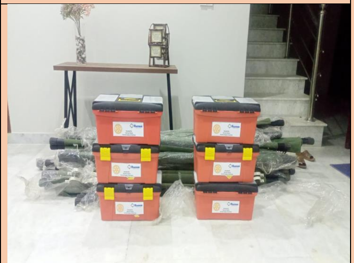
First Aid Kits for the Volunteer Groups