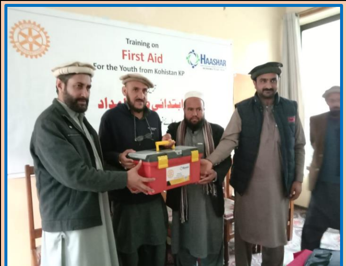
Handing Over the First Aid Kit to Volunteer Groups