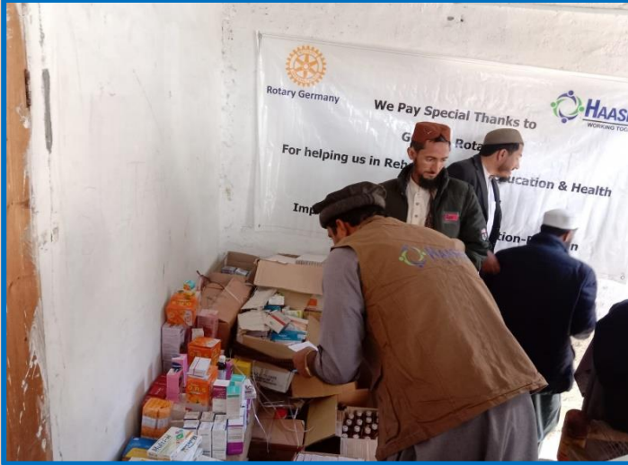
Medicines arranged for distribution in Medical Camp