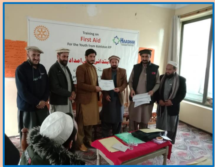
Distribution of Certificates after the Training