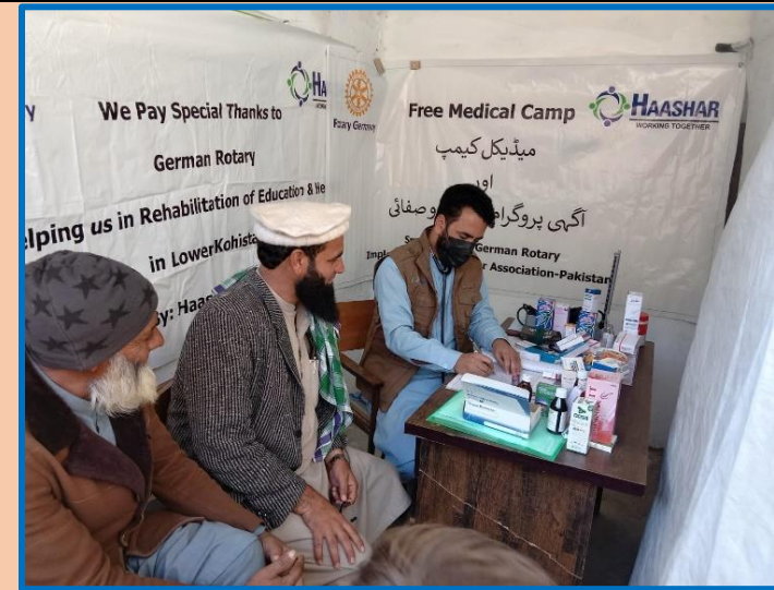
Medical Specialist examining a patient in Medical Camp