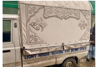
This school for blind girls is only financed by private funds yet.